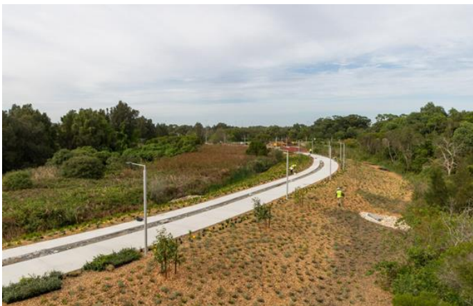
Shared pedestrian and cyclist pathway progress at Scarborough Park, April 2025

Residents near the work zones will receive a letterbox notification in advance of works commencing.