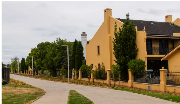
Shared pedestrian and cycle path alongside Brighton Terraces

The works may generate dust and moderate noise levels. We will manage dust by using a water cart and manage noise by using squawkers instead of beepers on vehicles. We'll turn off equipment and vehicles when they are not being used. We use noise and dust monitoring to measure our impact to the local community.