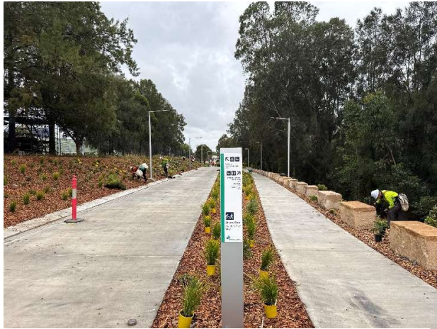
Shared pedestrian and cycle path entrance to the north of President Avenue

Road and lane closures around the work zone, temporary parking removal and pedestrian diversions may be in place to facilitate works. Please follow our traffic signs and the directions of traffic control. Traffic management will be in place to ensure the safety of workers and the community when working on or near live traffic. Temporary changes to traffic may occur near our site gates on President Avenue.