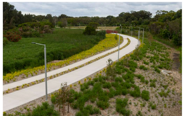
Shared pedestrian and cycle path at Scarborough Park

Respite for one hour will occur every three hours during high impact activities. High impact work on Saturday will finish by 1pm.