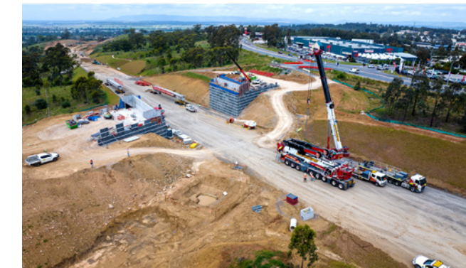
Bridge works at the Northern connection with Magpie Street.