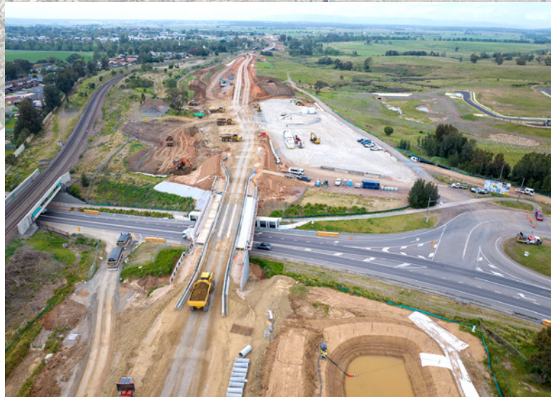
Bridge over the New England Highway at Gowrie - looking southbound towards the Hunter River, with haulage trucks transporting material from McDougalls Hill in the north to the south of the Hunter River.