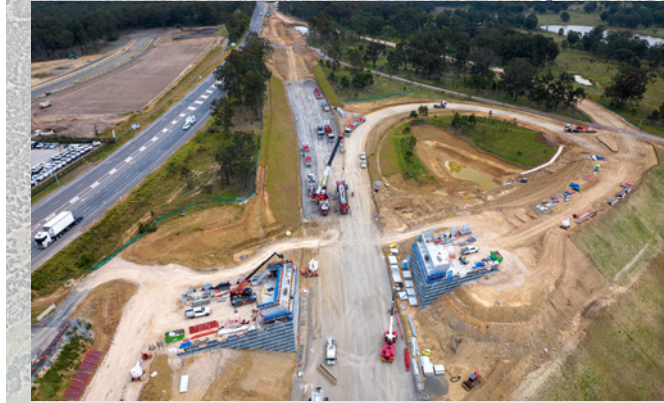
Looking northbound, the northern connection includes a G loop ramp configuration, providing southbound access onto the bypass.