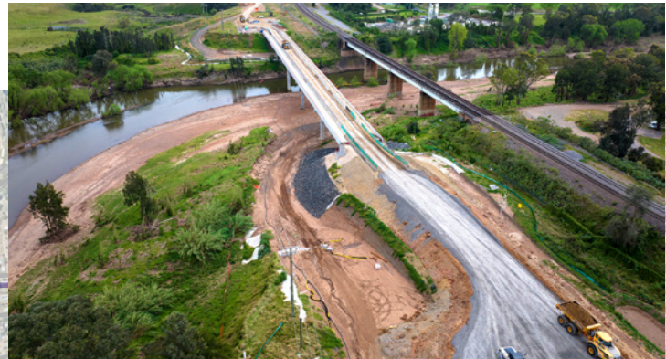
Bridge across the Hunter River measures 191 metres in length looking northbound towards Gowrie, with haulage trucks transporting material from McDougalls Hill in the north to the south of the Hunter River.