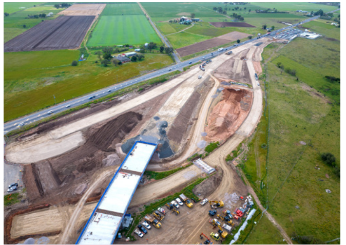
Southern Connection at Whittingham and the start of the first bridge measuring 600m in length - looking southbound.