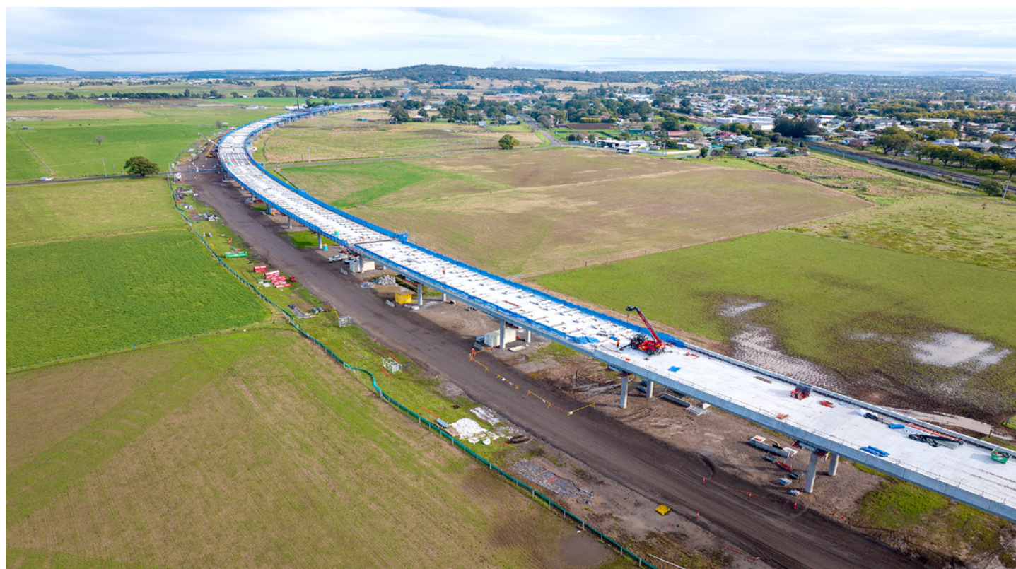
Bridge over Doughboy Hollow floodplain near Army Camp Road looking northbound

To minimise traffic impact and to manage concrete pours, we are currently carrying out night work in the project corridor on weeknights between 6pm and 7am, weather permitting. Residents impacted by this work have been notified.