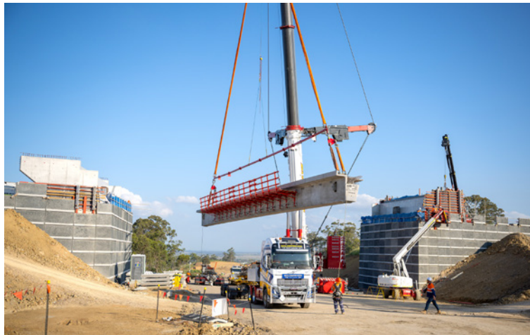
Installation of the Project's final bridge girders at the northern connection with Magpie Street.