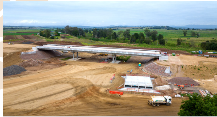
Bridge over the Rose Point floodway measures 99m in length at the Putty Road interchange.