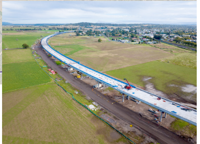
Bridge that crosses over the Great Northern Railway, Hunter River floodplain, Army Camp Road and Putty Road measures 1638m in length - looking northbound.