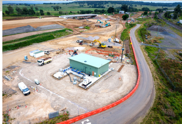
New water pump station at Waterworks Lane nearing completion.