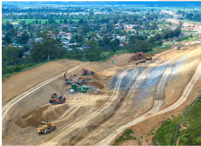
Earthworks at McDougalls Hill.