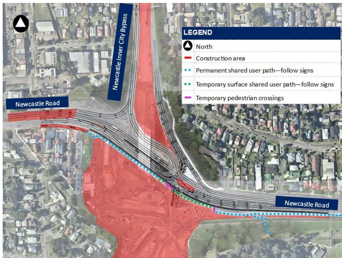
Jesmond - Northern Interchange

This is an artist impression only and is not to scale