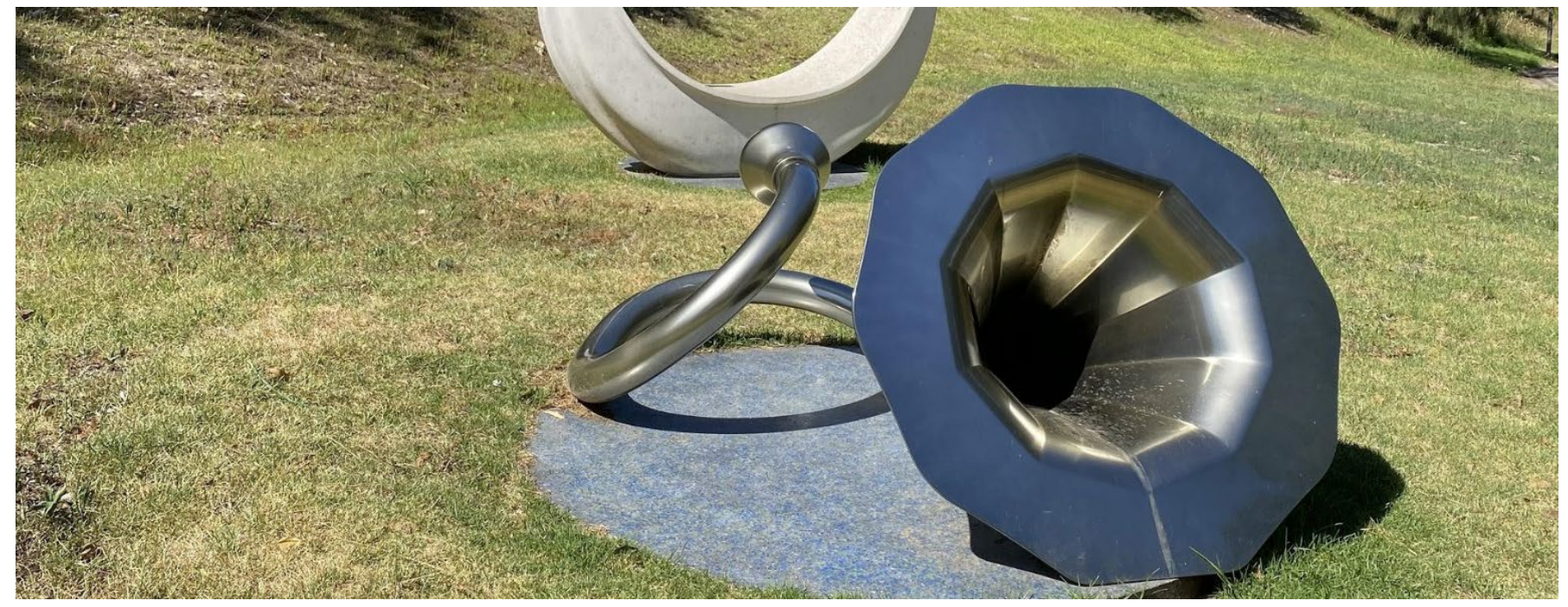
Australian stone—Pilbara marble, Chillagoe marble, Sydney 'Tunnel stone', heritage sandstone Approx. 12m Dia. \times 1m H