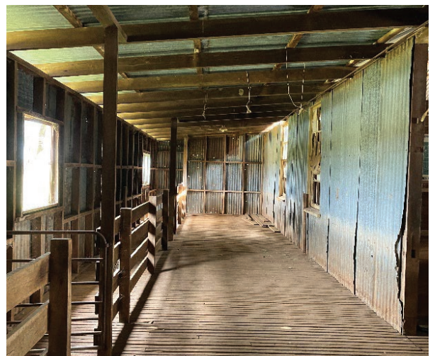
Photo: Stockton. 1920s southern extension, showing the internal window openings in the 1880s structure (at right).

Finalise the Historical Heritage Impact Assessment.