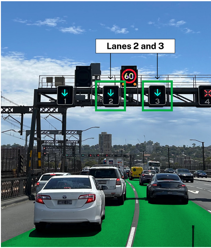
Image 1: Sydney Harbour Bridge northbound, use lanes 2 or 3 to access the Ernest Street northbound off ramp.