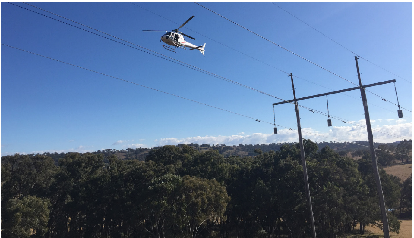
Pictured: Transmission line with vegetation clearance.

Restrictions about what you can and cannot do within Transgrid easements are captured in our Easement Guidelines that are available on our website.