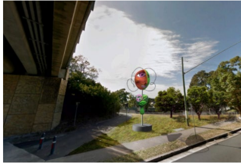
“CLOUD” – SOUTH-EAST GATEWAY

The two works at the northern entrances to the park - “Wind” and “River” - are young beings conversing across Kingsgrove Road. They are outgoing, inquisitive, adventurous.