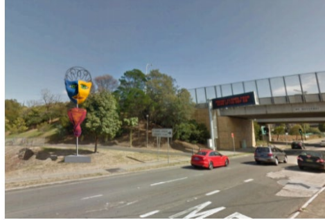
“SOLAR” – SOUTH-WEST GATEWAY