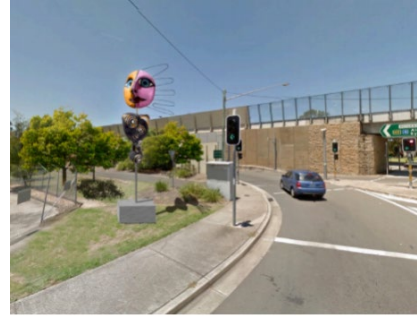
“WIND” – NORTH-EAST GATEWAY