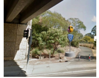
“RIVER” – NORTH-WEST GATEWAY