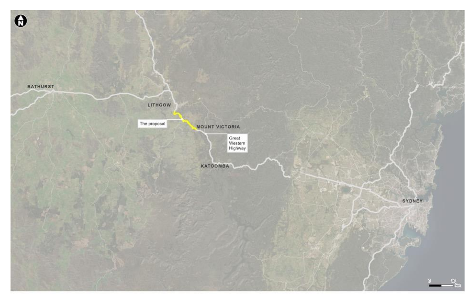
Figure 1-1 Location of the proposal