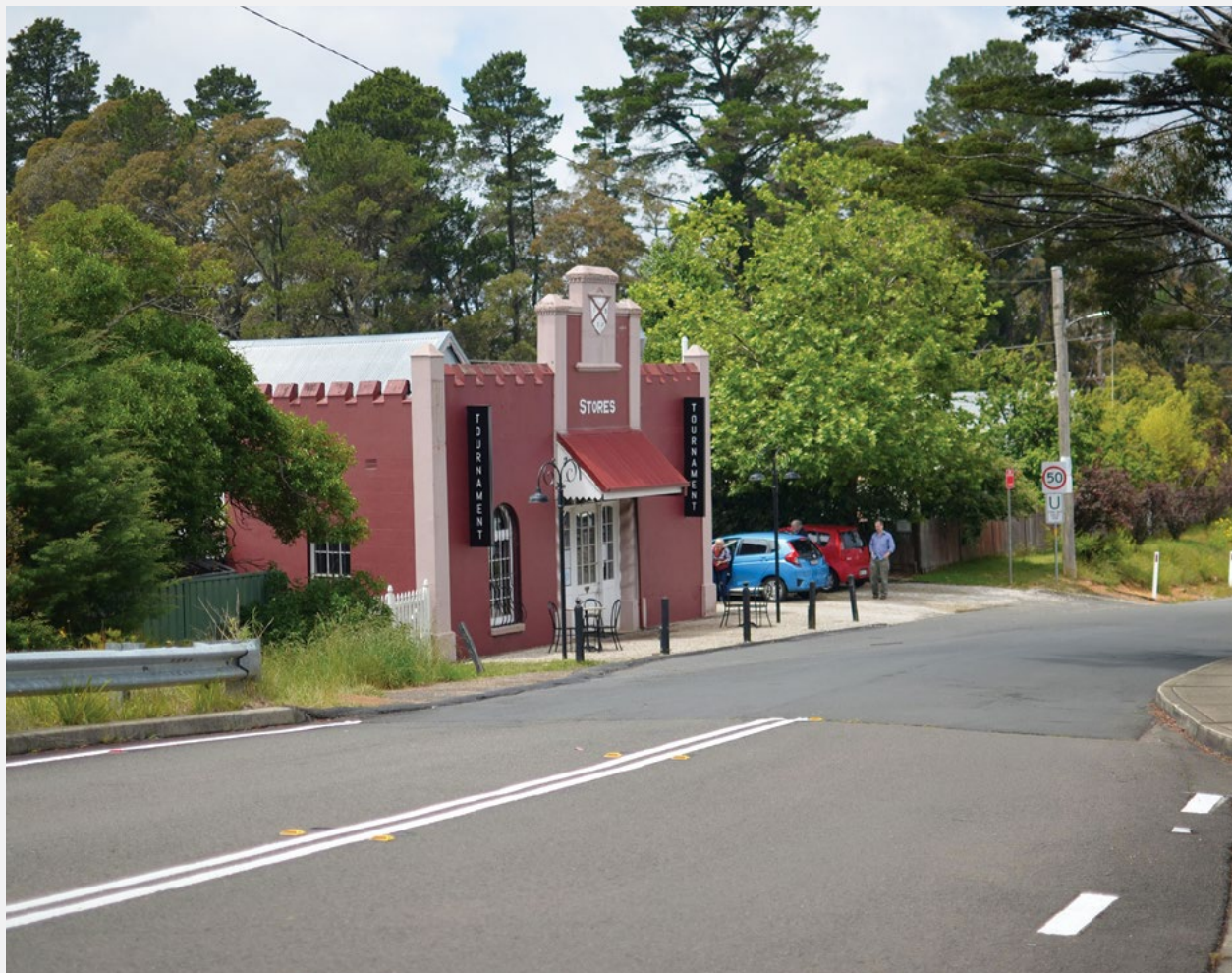
Design features will complement the existing charm of Medlow Bath

We will continue to seek your feedback throughout the project on opportunities to improve the visual and urban amenity of Medlow Bath.