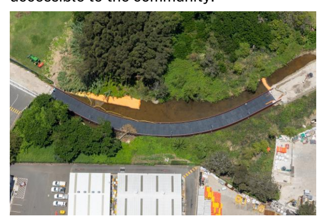
Image: Aerial photograph of Kings Wetland boardwalk and the shared pathway under construction in December 2024.

Work continues in February to construct the shared pathway either side of Kings Wetland boardwalk. Once complete, the shared pathway will connect residents from Kings Road to Bay Street, making the previously impassable area, accessible to the community.