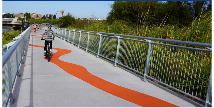
Construction and finishing works on the pedestrian and cycle path.