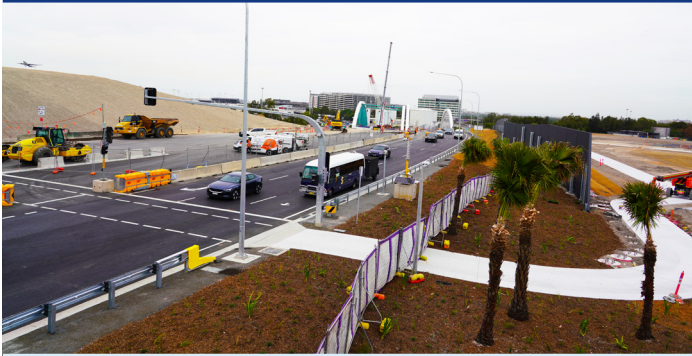
Noise barrier construction at our Tempe site continues.