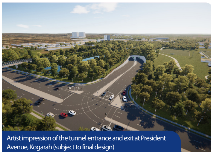
Artist impression of the tunnel entrance and exit at President Avenue, Kogarah (subject to final design)