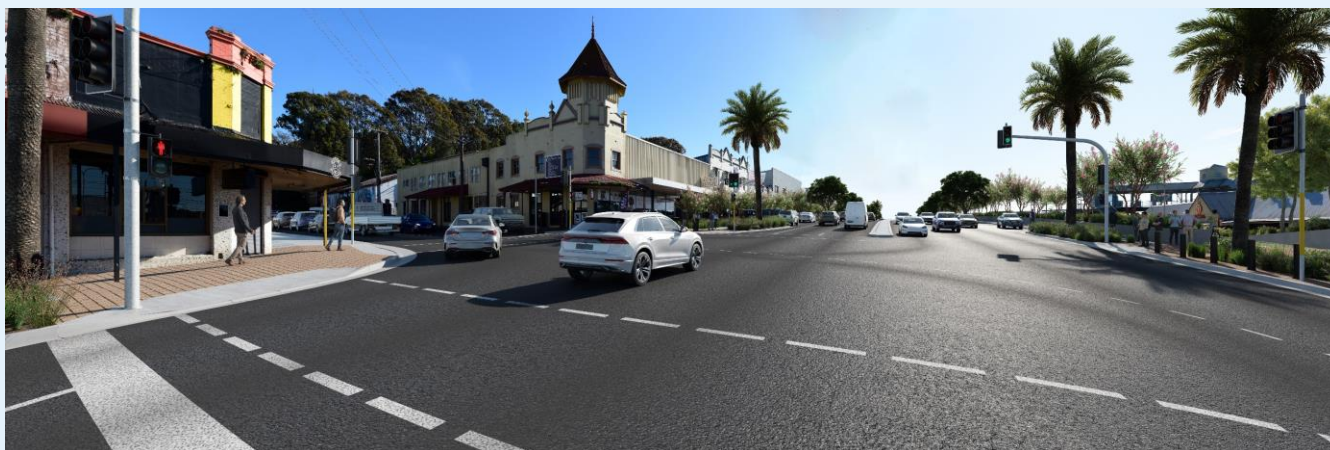
Artist's impression of the Pacific Highway at Church Street

The project will also improve connectivity to and across the Pacific Highway and Main North Railway, with improved intersections and a new wider and longer bridge over the railway at Rose Street.