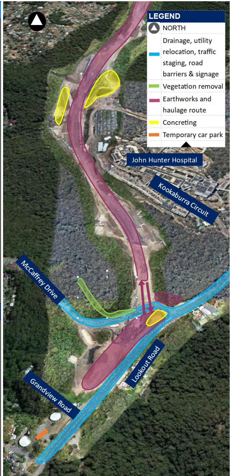
This is an artist impression only and is not to scale.