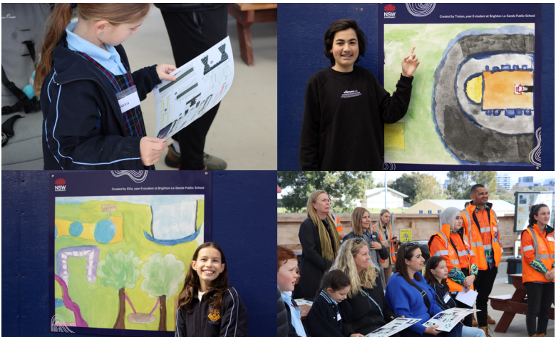
Students from Brighton-Le-Sands Public School with the artwork and during celebrations, August 2023

To celebrate the installation, we invited the students, current school leaders, and their families to attend a morning tea and unveiling ceremony. A fantastic way to commemorate the artwork which was enjoyed by all.