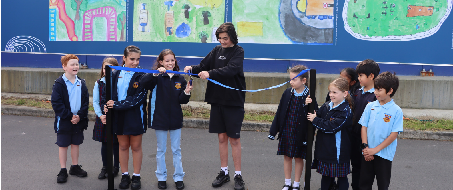
Ribbon cutting to commemorate the artwork installation, August 2023