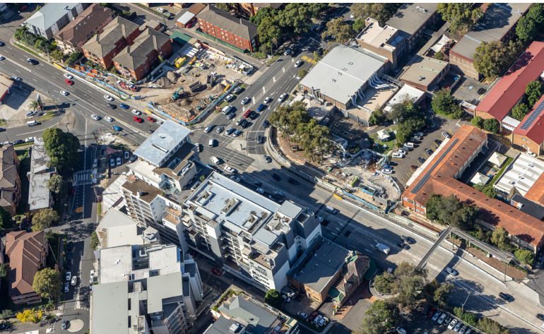
Continuous weekend work site – Princes Highway near President Avenue

Access to local businesses along the Princes Highway, President Avenue and West Botany Street will be maintained during our work. Support local businesses and shop local when you can.