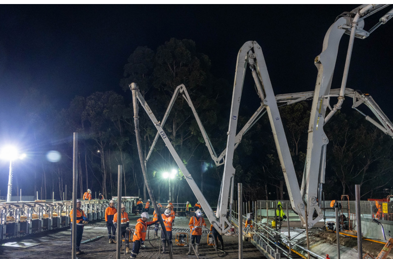
Tunnel portal roof pour at the Bicentennial Park site, July 2023

Complex construction is happening at Bicentennial Park, where we are building the entry and exit of the tunnel. More than 640 cubic metres of concrete, along with 182 tonnes of reinforcement have come together to form the first part of the tunnel roof. Wherever practical, materials are sourced locally, helping to support local jobs.