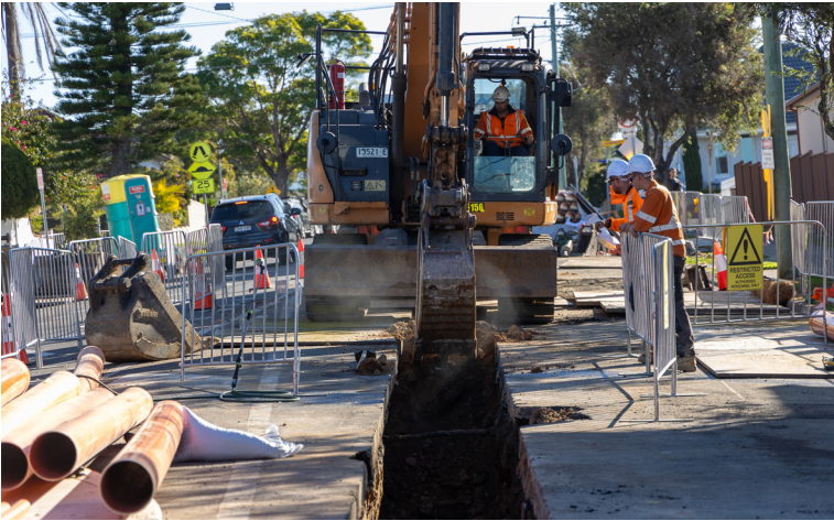
Permanent Power Supply work on Bryant Street, August 2023

As at the end of August, we had completed over 43 per cent of the trenching on roads, including underbore works at Bardwell Valley Golf Course. This is great progress and puts us on schedule to complete laying the power cable by early 2024.