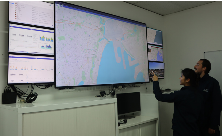
Spoil management control room

The data captured by the software also plays an increasingly vital role in sustainability reporting. For example, a combination of intelligent earthworks data and off-site spoil data can be used to determine what percentage of materials removed from site are being reused.