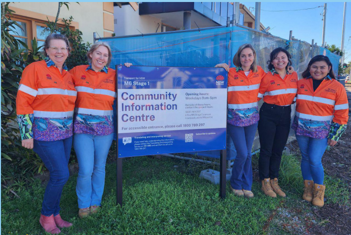
Members of the team outside the Community Information Centre

Come and meet the team to discuss any questions you may have, look at maps, artist impressions and learn more about the Project. We look forward to your visit.